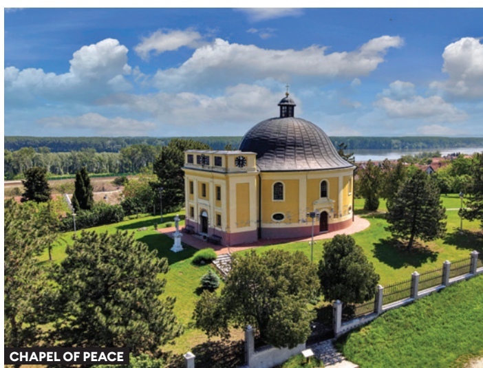
CHAPEL OF PEACE

A place with a view of Sremski Karlovci, its cultural and historical monuments and the Bačka plain. The most important part of the Vidikovac is an open scene with two levels on which there is a gilded cross (erected on the site where a wooden cross used to be decades ago) and sculpture of the poet Duško Trifunović.