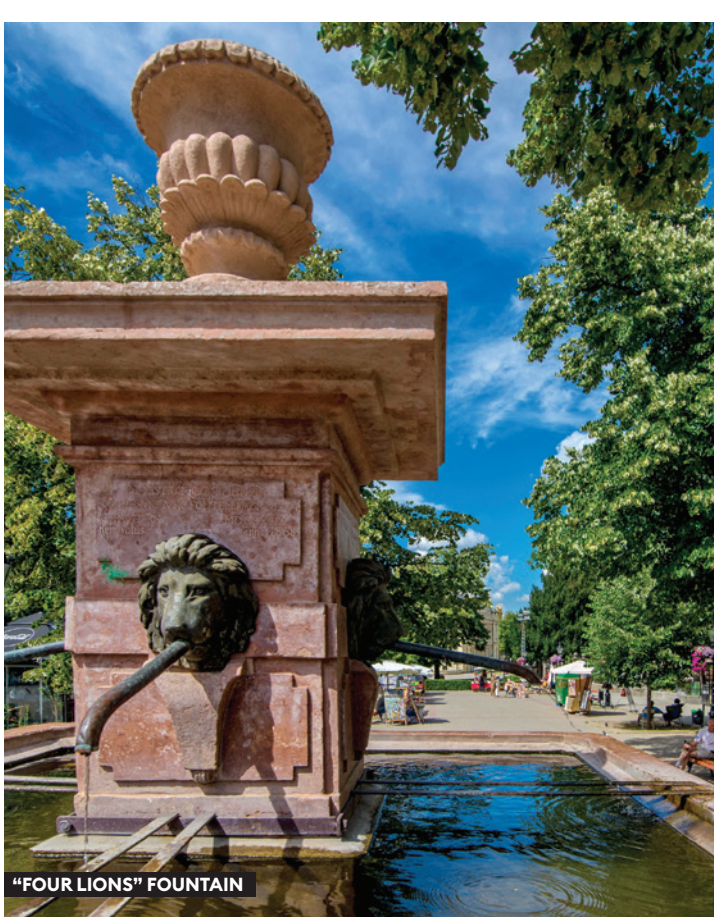
"FOUR LIONS" FOUNTAIN