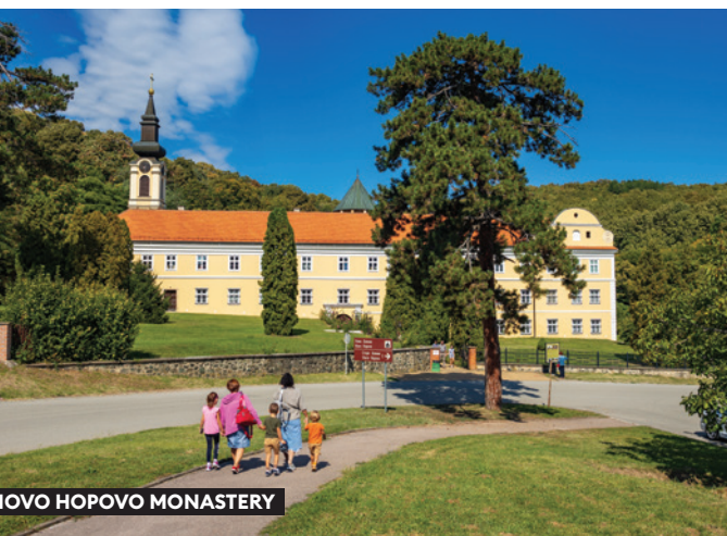
NOVO HOPOVO MONASTERY

Sremski Karlovci is about 80 km away from Belgrade, and only 11 km from Novi Sad.