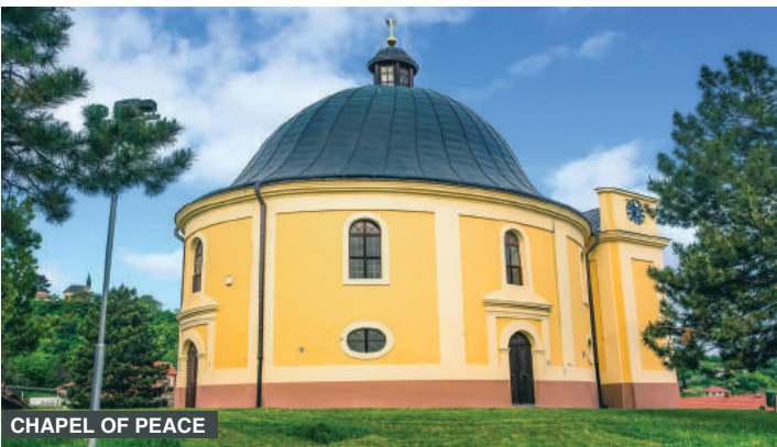
CHAPEL OF PEACE

This is a place with an amazing panoramic view of the town of Sremski Karlovci, its cultural and historical monuments, as well as the lowland of Bačka region. The most significant part of this spot is an open-air stage which consists of two levels. There is also a huge gilded cross built instead of the wooden one that stood there