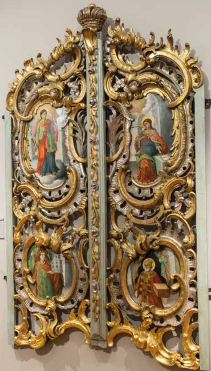
Gallery of Matica Srpska