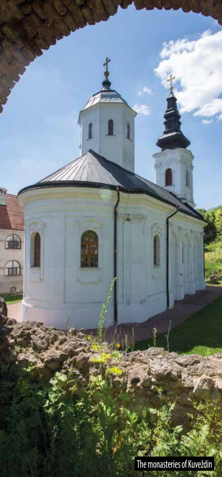
The monasteries of Kuveždin