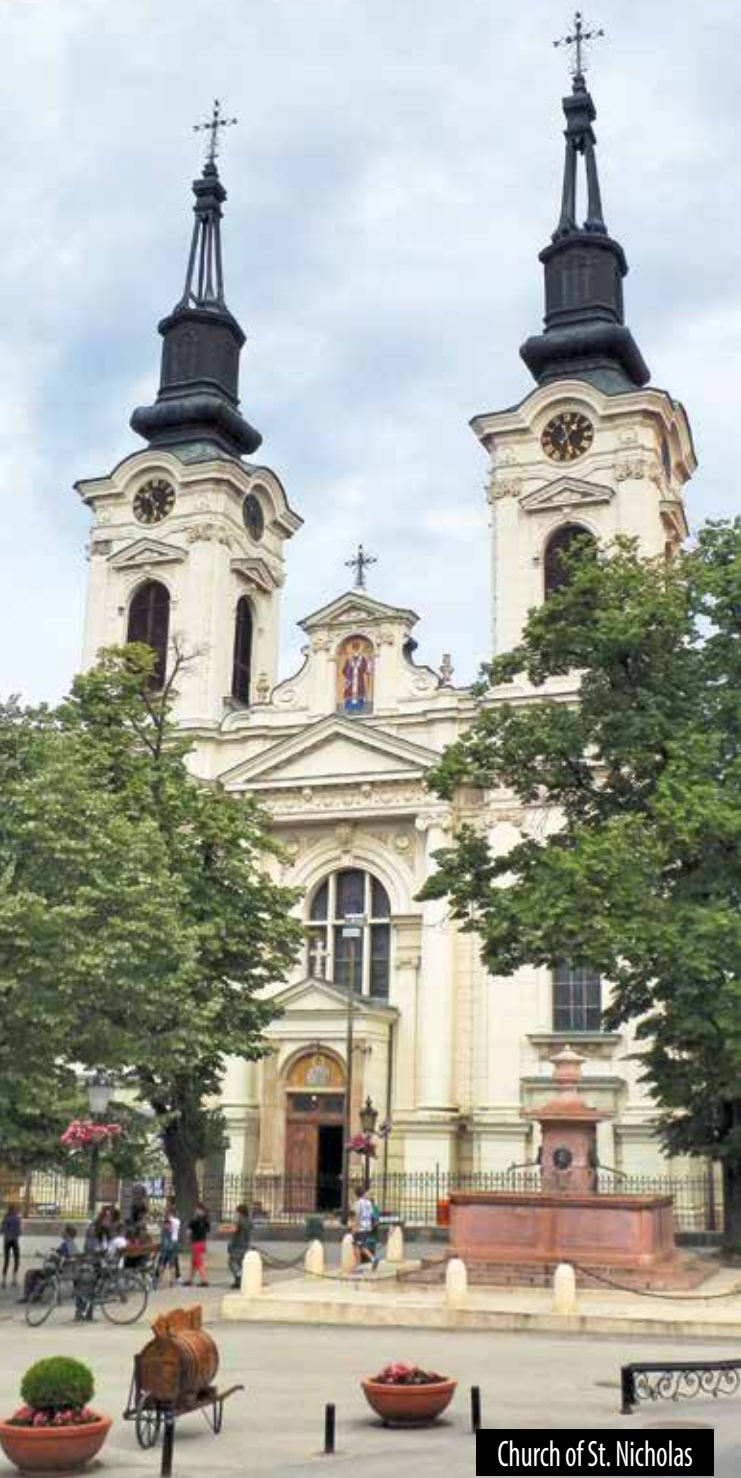
Church of St. Nicholas