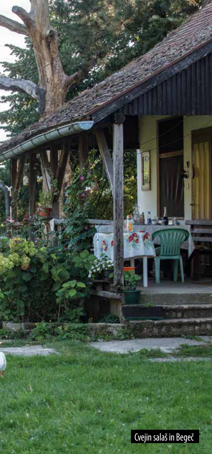
Cvejin salaš in Begeč