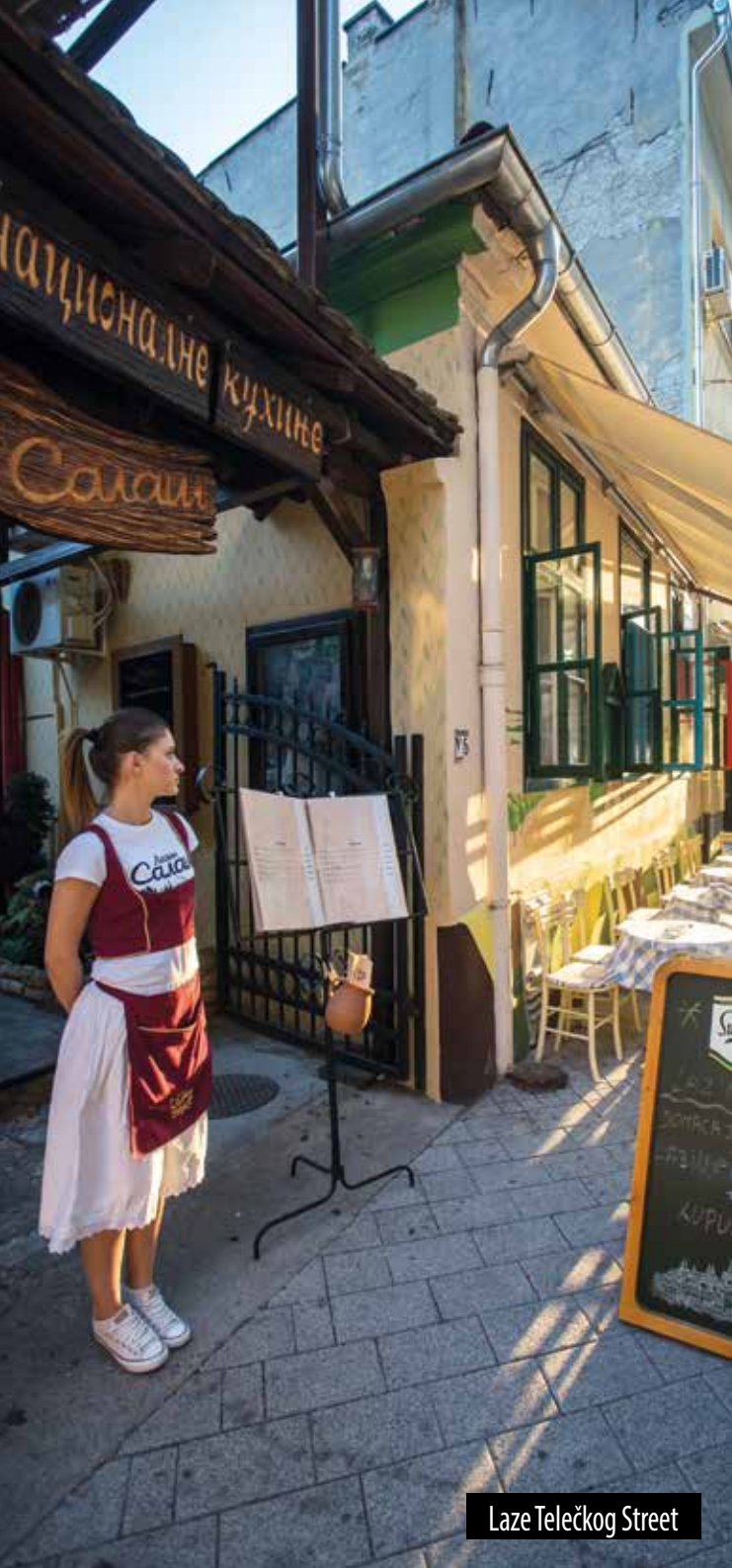
Laze Telečkog Street